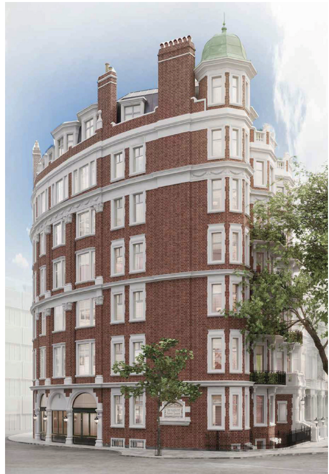
An illustration of 1 Sloane Gardens hotel redevelopment

This development will convert two houses into six residential apartments. Construction works, led by OD Projects, commenced in late 2016 and are expected to be completed in May 2018.